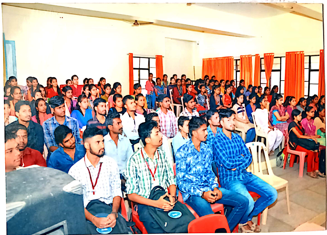
All the students and Teachers attended this lecture on "Time Management" in the Programme of Inauguration of Commerce Forum.